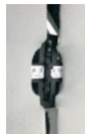
Adjustment Wheel Petite Only