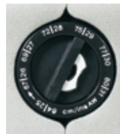
Auto-set Adjustment Dial