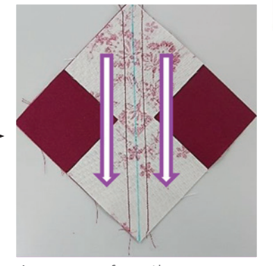
As you sew from the same direction, the fabric stays flatter