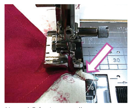
Normal O foot: seam allowance can get caught in the guide plate.