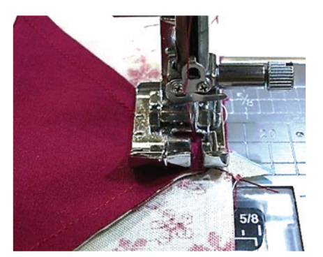
No guide O foot: smoothly sew the overlapping seam allowance areas.

You can sew smoothly without the guide plate getting caught where the seam allowance of the piecing overlaps.