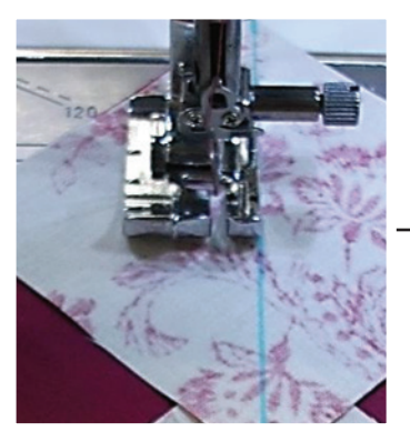
Align the edge of foot with the mark and sew.

Good for Flying Geese or Half Square Triangle piecing!