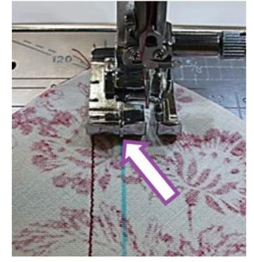
Match the 1/4" guide line with the mark and sew. As the guide line is raised, it is easy to align with the mark.