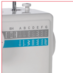
13 Stitches & 1 Four-Step Buttonhole