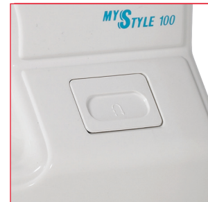
Easy Reverse Button