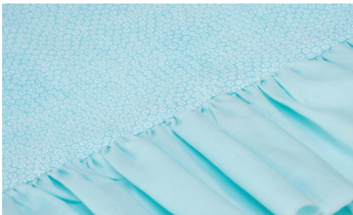
Full Featured Single Unit Differential Feed We've taken the differential feed to a new level by adding a single-unit feed dog mechanism. This ensures stronger feeding as well as consistent gathering on all fabrics.