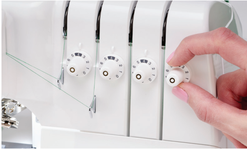
Micromatic Twin Cam Tension System Eliminates thread tangles and delivers proper tension with all threads on any fabric.