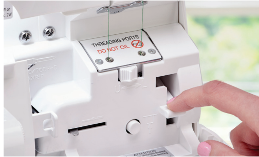
Jet-Air Threading™ With just the touch of a lever, thread is sent through the tubular loopers. There are no thread guides, no struggling and there's plenty of time to serge away!