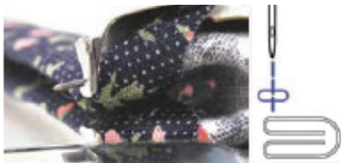
TOP AND BOTTOM ARE SET AT THE SAME LENGTH. THIS IS BEST FOR USING A STRAIGHT STITCH.

The two upper screws adjust to allow you to set the position of the binding's top and bottom folds. Once you have set the position of the folds, place the attachment on the base and align the folded fabric with the needle.