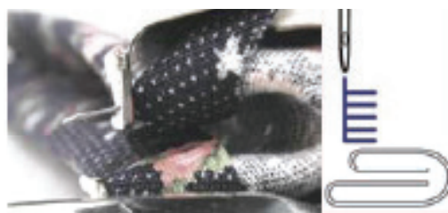
THE BOTTOM FOLD IS SET FURTHER FORWARD THAN THE TOP FOLD. THIS IS BETTER FOR A BLANKET STITCH.