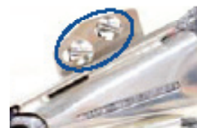
FINE TUNING SCREWS