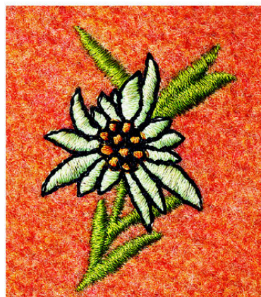
Fig. 4: Detail of Bavarian jacket