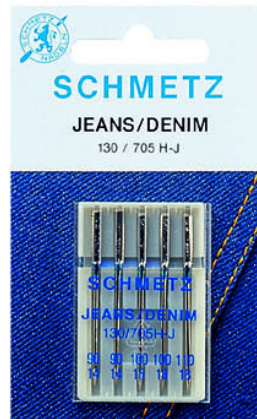
Fig. 7: JEANS NEEDLE

With slim, acute point for easier penetration of thick fabrics and with reinforced blade, which causes less deflection of the needle. The special shape of the scarf reduces the risk of skip stitches.