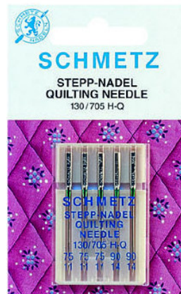
Fig. 8: QUILTING NEEDLE

With slim, acute point, which is slightly rounded in order to penetrate thick layers of material easier during quilting by machine. Achieves accurate seams in quilting where many seams frequently cross each other and avoids damage in sensitive and often expensive materials used in patchwork.