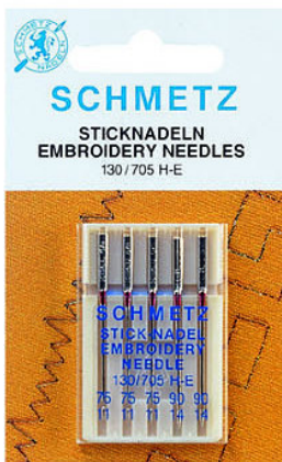
Fig. 3: EMBROIDERY NEEDLE

Application: Embroidering with embroidery threads and effect threads using decorative techniques as well as the embroidering with the embroidery unit.