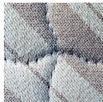
Fig. 12: Detail

In order to carry out a successful work, the needle has to be replaced regularly. Only a damage-free needle point permits to sew in professional quality and avoids thread breakage. In the future, pay more attention to your needle – the high quality and effect of your work will be visible.