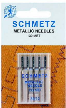
Fig. 5: METALLIC NEEDLE

Developed specially for metal effect thread, with very long eye (2 mm in all needle sizes) in relation to the needle thickness. The eye is even longer than in needle system 130/705 H-E (for embroidering) and remains the same in all needle sizes. The longer eye and the special groove allows the thread to glide easily and gently through the needle (and therefore prevent thread breakage).